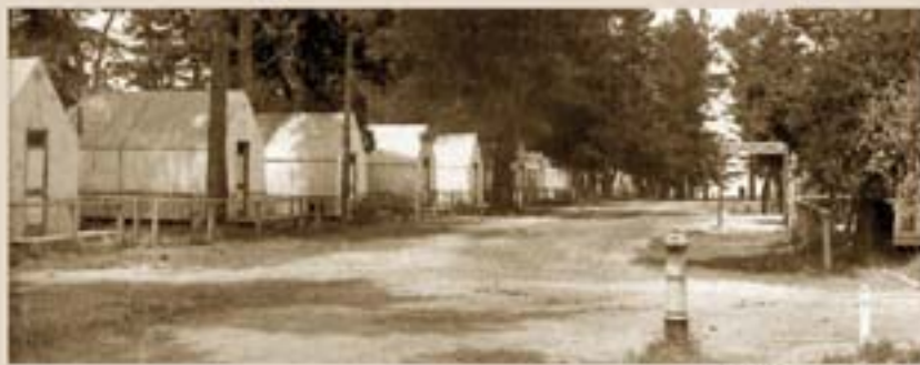
Tents on 16th Street, c. 1880

In August 1874, the original Chautauqua Institution was founded in western New York State. The summer festivities included Sunday school teacher-training classes, musical entertainment, lecturers, and recreation. In 1878, the Chautauqua Literary and Scientific Circle, a four-year course of required readings in various subjects, was created. This was often the only opportunity for higher education in the days before colleges reached areas outside of large population centers.