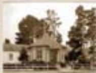
Chautauqua Museum, c. 1900

In 1879, the first Pacific Coast assembly was held in Pacific Grove. The P.G. Retreat Association was established in 1875 by a group of Methodist ministers meeting in San Francisco. They selected the site currently occupied by Jewell Park for their camp meeting ground.