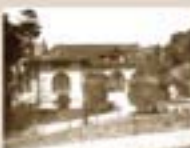
Carnegie Library, c. 1908

In 1881, the Pacific Improvement Company (predecessor of the Pebble Beach Company) provided the large wooden hall – now known as Chautauqua Hall – that served a variety of uses, including a CLSC classroom. It's now a National Registered Landmark. In 1883, the P.I. Co. donated a small octagonal building to hold the growing collection of specimens and books. In 1932, a permanent museum building was built at the same site. The museum also contained a library, which evolved into the P.G. Public Library housed in the Carnegie library building (1908) we still enjoy today.